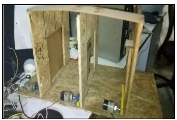
Figure 3: Bank Model