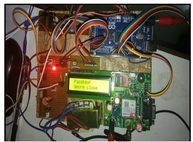
Figure 4: Hardware Interfacing

ISO 3297:2007 Certified Vol. 6, Issue 4, April 2018